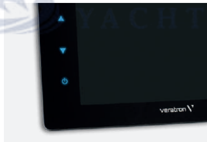
Lateral touch buttons are RGB illuminated and allow for a quick brightness adjustment