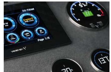
The VMH series look and feel gives an elegant and stylish touch to your dashboard