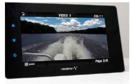
Every place of the boat is under your control thanks to the dual video input