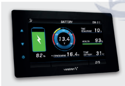
Intelligent Battery Sensor (IBS) screen to keep your energy supplies under control

The embedded NMEA 2000® gateway brings all the sensor readings and alarms to your external multifunctional display, saving the cost of an additional converter.